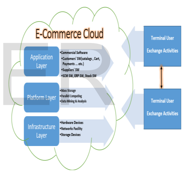
Figure 5: the proposed model for B2C e-commerce based on Cloud Computing

interface and application program interface (API). The Application Layer consists of B2C e-commerce services. This layer provides a software-based for product management, customer management, and enterprise resources planning. E-commerce B2C application provides a software-based for a payment system and an ordering system. The most common mechanisms are an electronic catalog; a search engine that aids the customer find products in the catalog; an electronic cart for holding items until checkout; a payment gateway where payment arrangements might be made; and customer services, which include product and warranty information. Logistic service provides a softwarebased for stock management and shipping arrangements. It also providesfunctions and interaction interfaces for customers or other programs. Software-based services are obtained via the Internet that user access by a web browser.