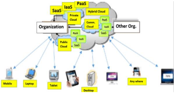
Figure 2: Types of Cloud Computing

Google considers that the cloud computing would provide consumers data storage and computing services in a secure, fast and the most convenient possible way [13]. According to Mel and Grance [14], cloud computing permits users to customize network related resources, applications, and services depend on the demand. Additional definition of the cloud computing is a dynamic computing environment that permits scalability and provides virtualized resources as service over the Internet [15].