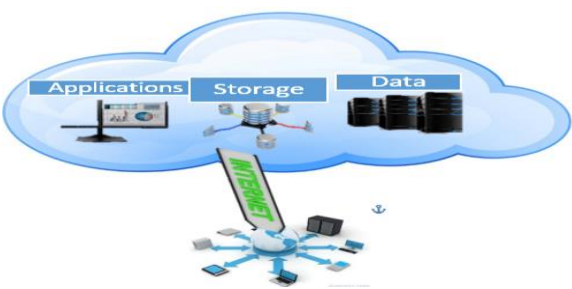
Figure 1: Cloud Computing Technology

Cloud computing [4] is a computing model, where a huge pool of systems is connected together in private or public networks, to offer dynamically scalable infrastructure for application, data and file storage, see figure 1. With the advent of this technology, the cost of computation, application, storage and delivery is reduced significantly. Cloud computing services have three distinctive features that distinguish it from traditional hosting. It is traded on demand, typically by the minute or the hour; it is flexible; a user can have as much or as little of a service as they want at any given time; and the service is fully managed by the cloud computing service provider.