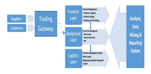
Figure 4: Tradition B2C e-commerce system

With e-commerce business, the suppliers can decrease the cost of managing their inventory of goods that they can automate the inventory management using web-based management system. Indirectly, they can save their operational costs. Lastly, the Frontend layer is where customer might process the ordering. The processing starts with the browsing of the product catalogue. Then, the customer selects a product to cart and checks out the order. This layer also includes handling of payment and logistic service. Additionally, the e-commerce company sellers may have to collect, store, analyze, and afford access to data center to assist company users make better business decisions.